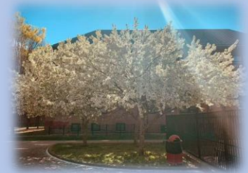
Beautiful Blossoming Tree – Andrew Jackson North

Last month, we resumed our "Meet and Greet with the Director" series for the first time in two years and presented a draft of the "Drug Abuse and Other Criminal Activity Policy", formerly known as the "One Strike" policy. We invite you to take a look at the draft, then provide your input, comments, opinions, and suggestions.