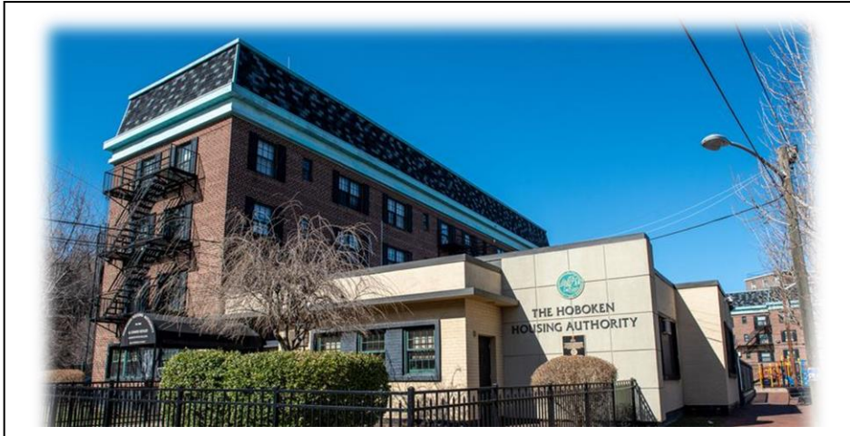
The Hoboken Housing Authority, Main Office Located at 400, Harrison St.

Hoboken Housing Authority 400 Harrison Street Hoboken, NJ 07030 P: 201-798-0370 www.myhhanj.com